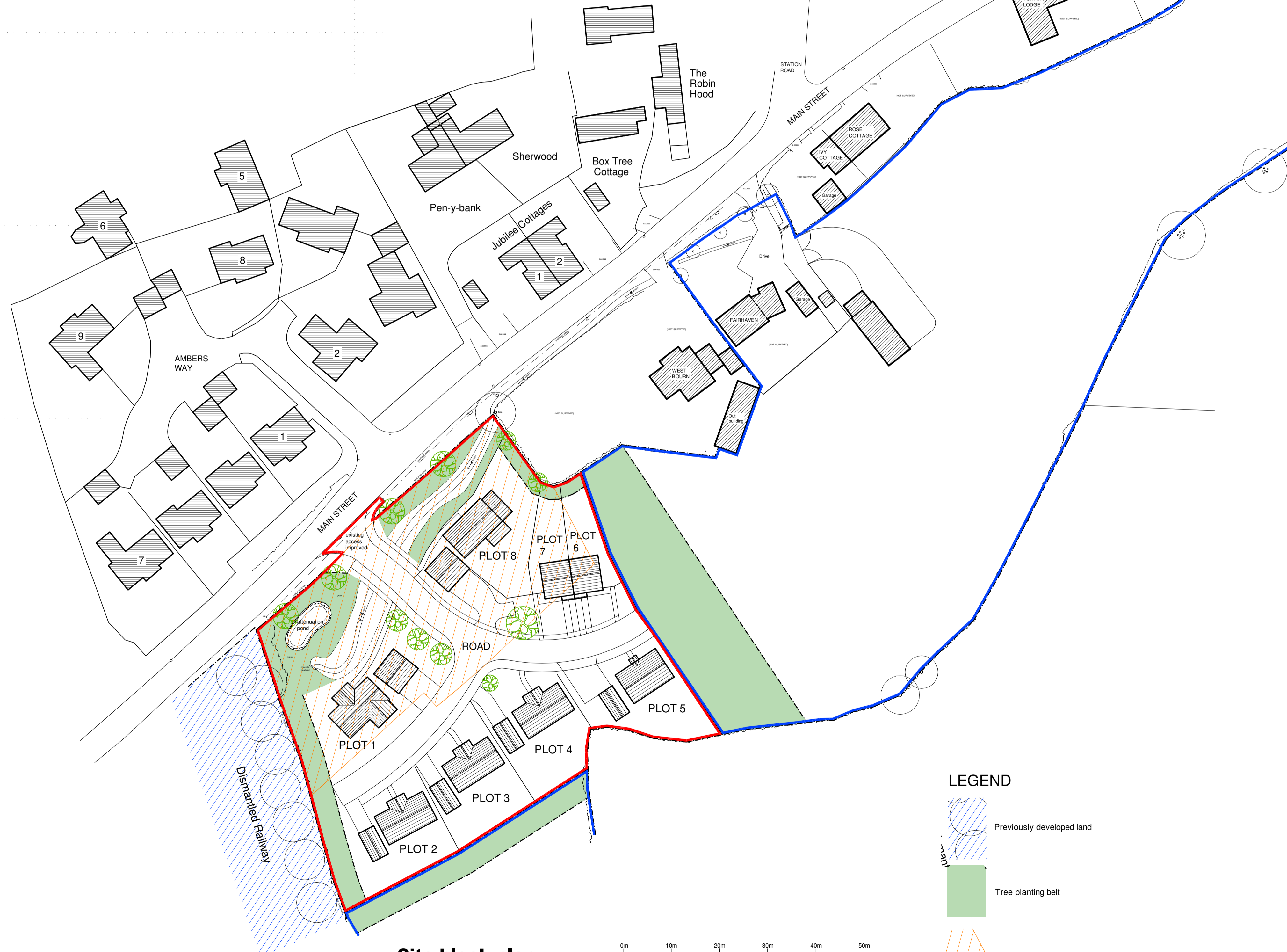
Site block plan Scale 1:500